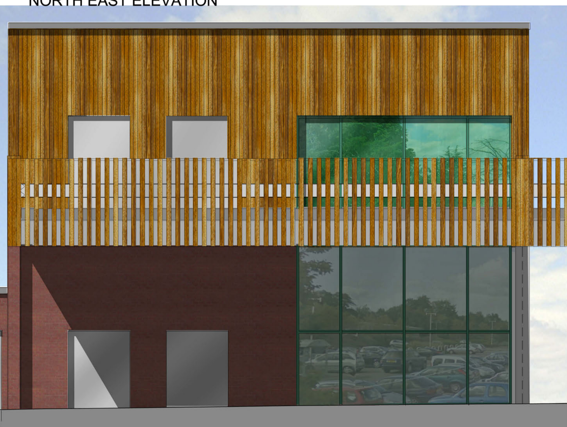
PART NORTH EAST ELEVATION - 1:50