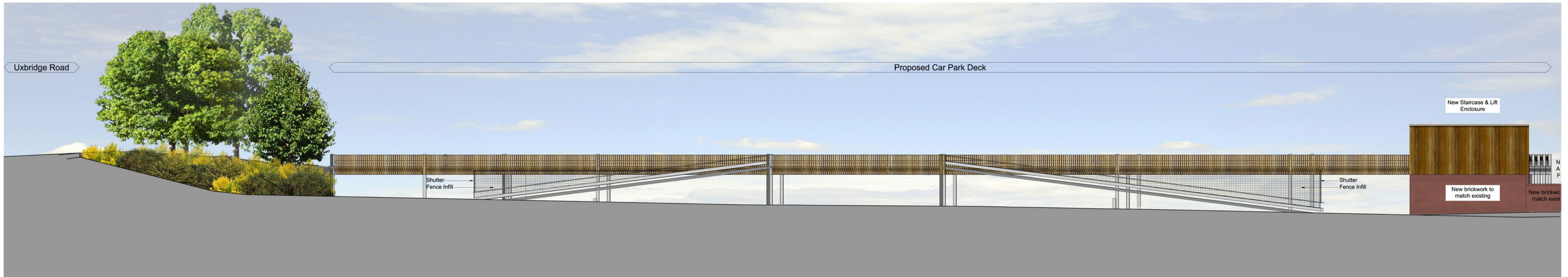
ELEVATION FROM RAILWAY LINE

Approval/Particulars on the information shown should be obtained prior to being used as a basis for any contract. Drawing based on Ordnance Survey data and is subject to a full line & level survey. This drawing as been prepared subject to the following: 1. Planning Approval 2. Building Regulation & Fire Officers Approval 3. Fire Officers Approval 4. Highways Approval 5. Enquiries on location of Statutory Utilities services & equipment. Contractors to check dimensions and notify any discrepancies or errors to the company immediately. Work to figured dimensions only. Do not scale. © All Rights Reserved.