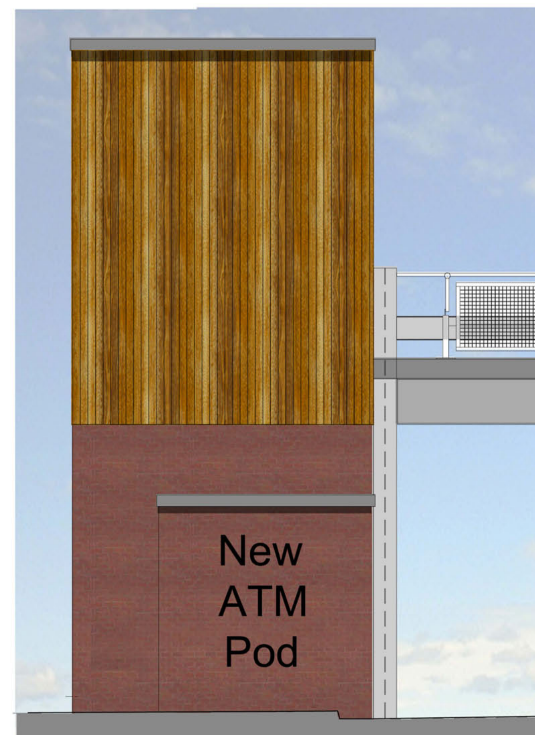
PART SOUTH EAST ELEVATION - 1:50